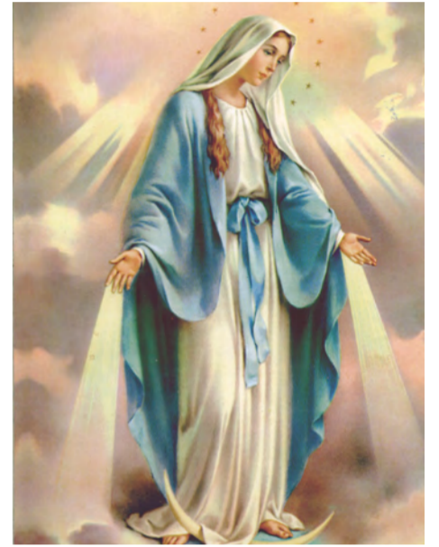
Our Lady of Grace