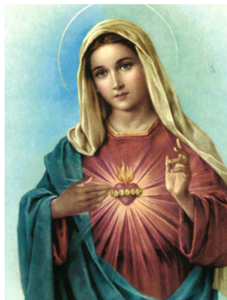
Immaculate Heart of Mary