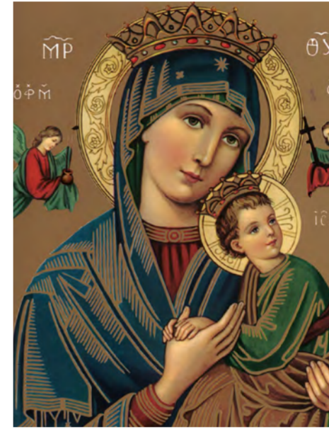
Our Lady of Perpetual Help