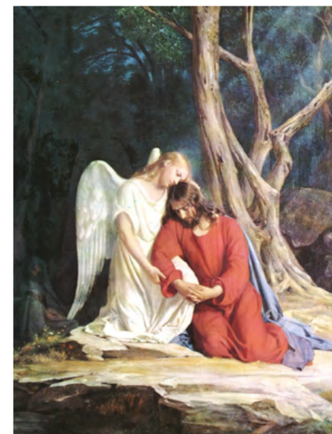
Agony in the Garden - Angel