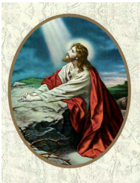
Agony in the Garden