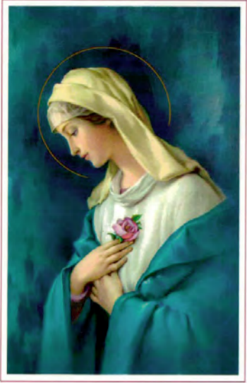
NEW Madonna with rose

An enrollment with the Jesuits is a promise to members that they will share in the Masses and Prayers that Canadian Jesuits say for their friends and benefactors.