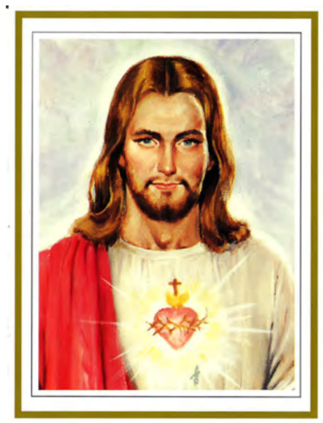
Sacred Heart of Jesus 2