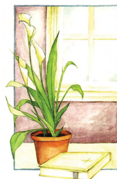
Bible and Flower