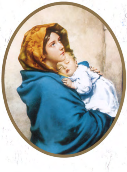
Mother & Child